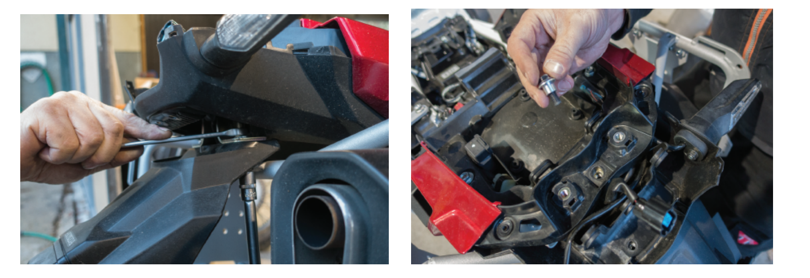
16. Re-insert the top middle bolt you removed in step #7. Tighten it.